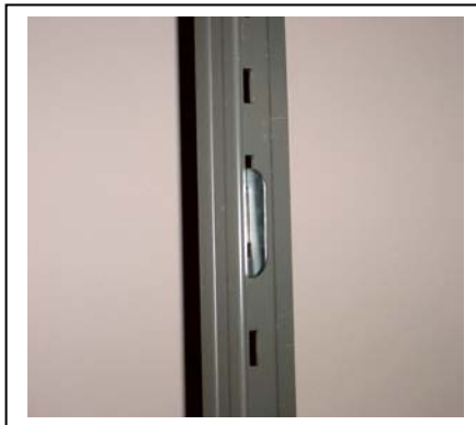
CLIP INSERTED (BACK)