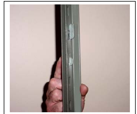
CLIP (SHELF SIDE)