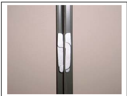
CLIPS (TWO SIDES)